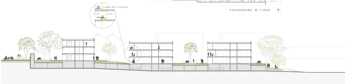
SCHNITT A-A M 1:200