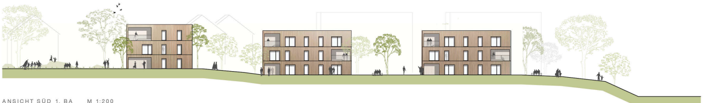
ANSICHT SÜD 1. BA M 1:200